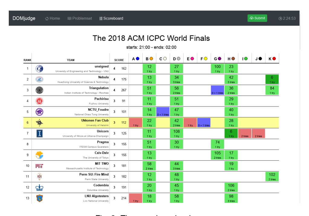
Fig. 2: The scoreboard webpage.