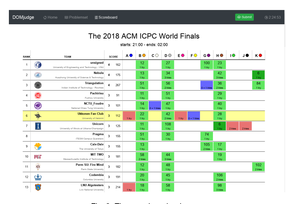
Fig. 2: The scoreboard webpage.